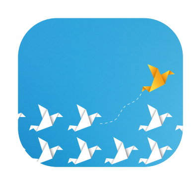
WORKFLOW CHANGES IN PRACTICE