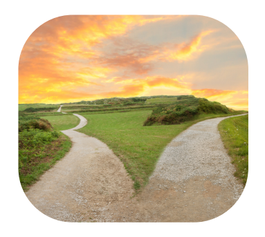
TWO TRACKS: EDUCATION AND QI